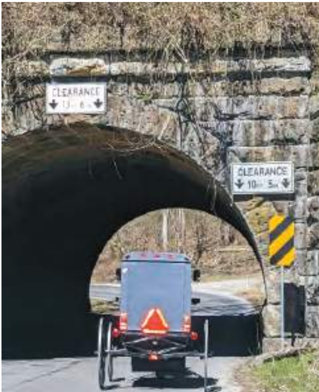
Multimodal transportation improvements can help to ensure safety for all road users.