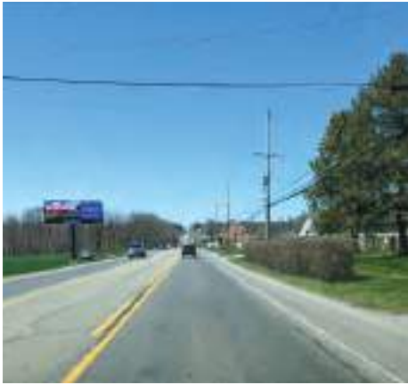
There are a variety of types of roadways in West Sadsbury.