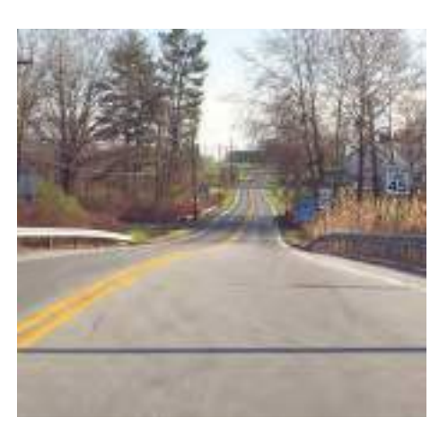
There are multiple PennDOT owned roadways in West Sadsbury.