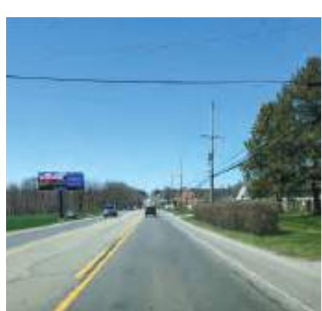
There are a variety of types of roadways in West Sadsbury.