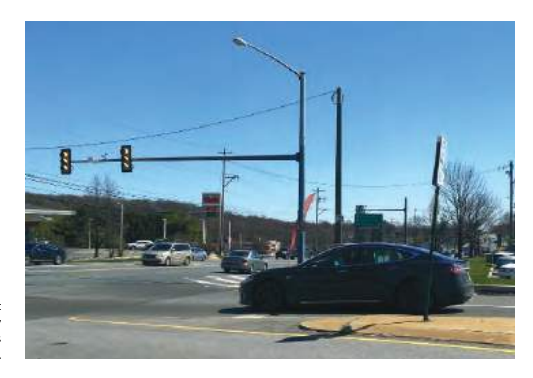
A transportation impact fee can be assessed to new development in proportion to its impact on transportation.