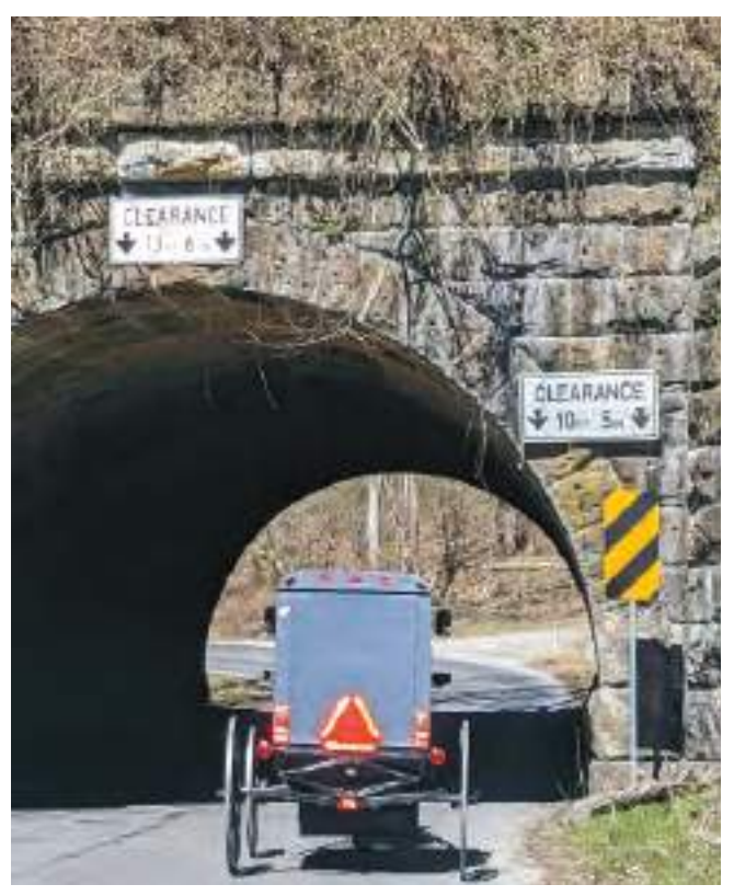
Multimodal transportation improvements can help to ensure safety for all road users.