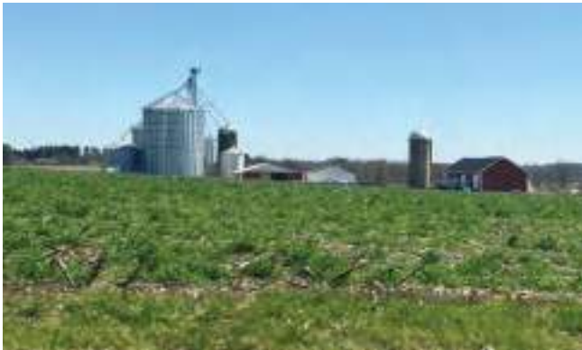
Agriculture is a significant part of West Sadsbury’s heritage, culture, and landscape.