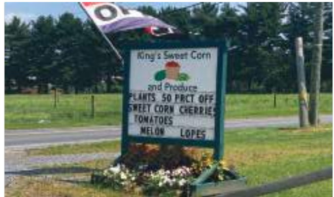
Tools such as the Township’s zoning ordinance can permit and encourage diverse agricultural uses, such as secondary farm businesses.