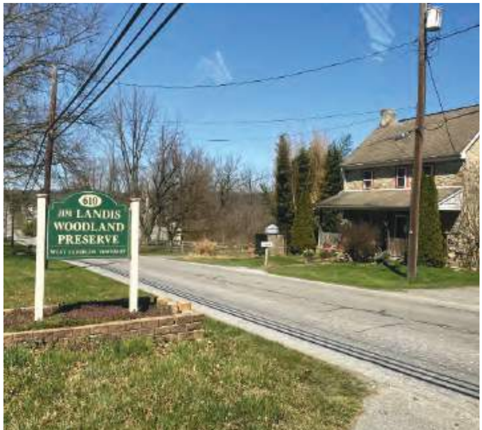
The Jim Landis Woodland Preserve offers passive recreation opportunities for Township residents.