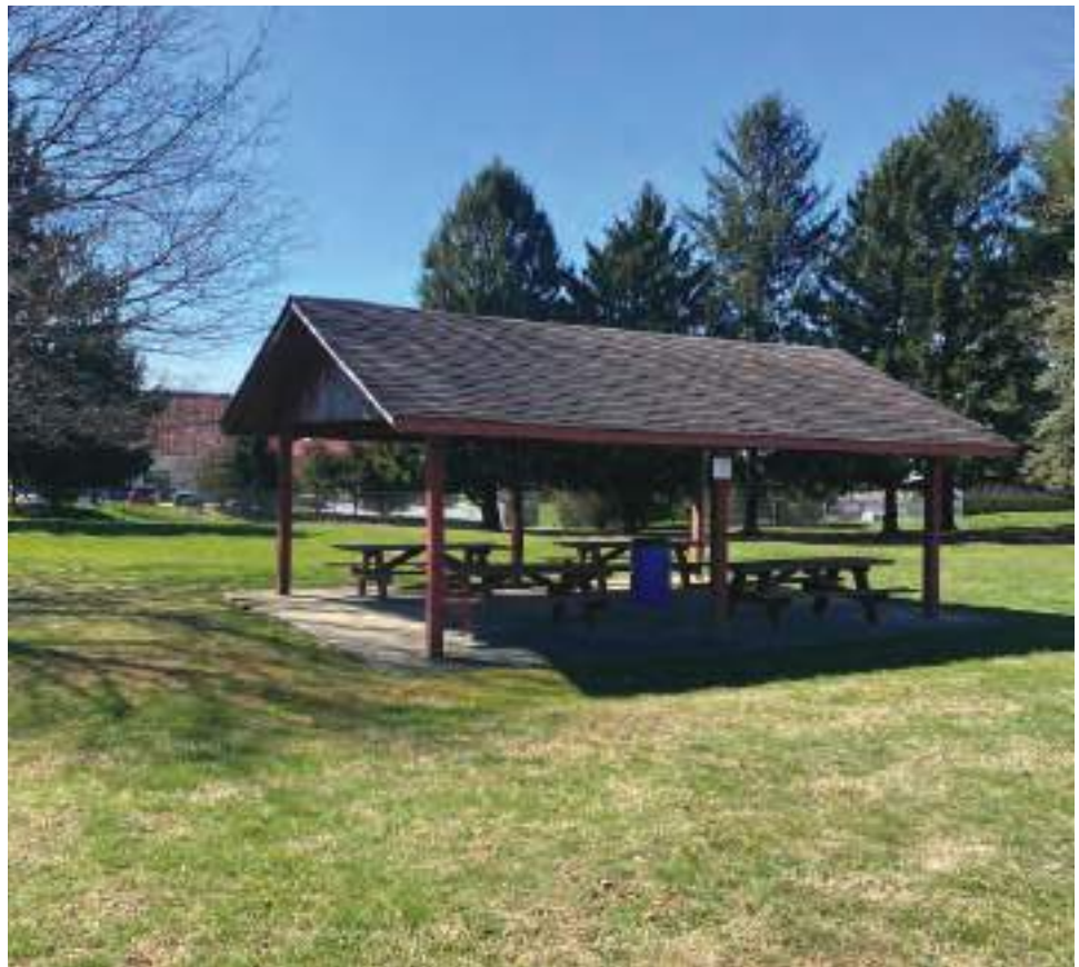
West Sadsbury Park contains picnic pavilions, a children's playground, and baseball fields.