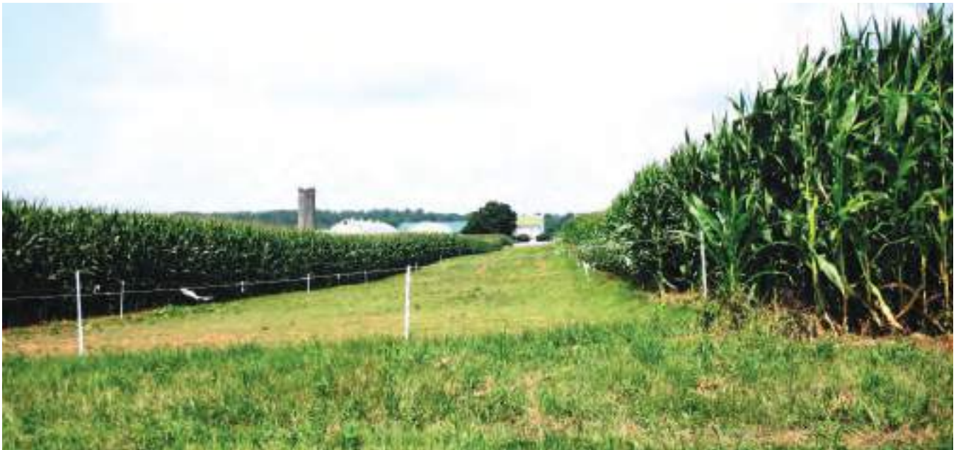
Conservation easements permanently protect land while allowing private landowners to maintain ownership and control of their land.