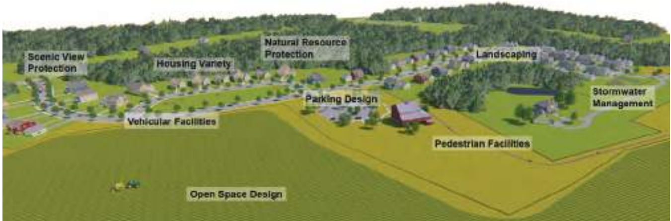
Conservation developments protect open spaces and natural resources while allowing for residential development and associated amenities.