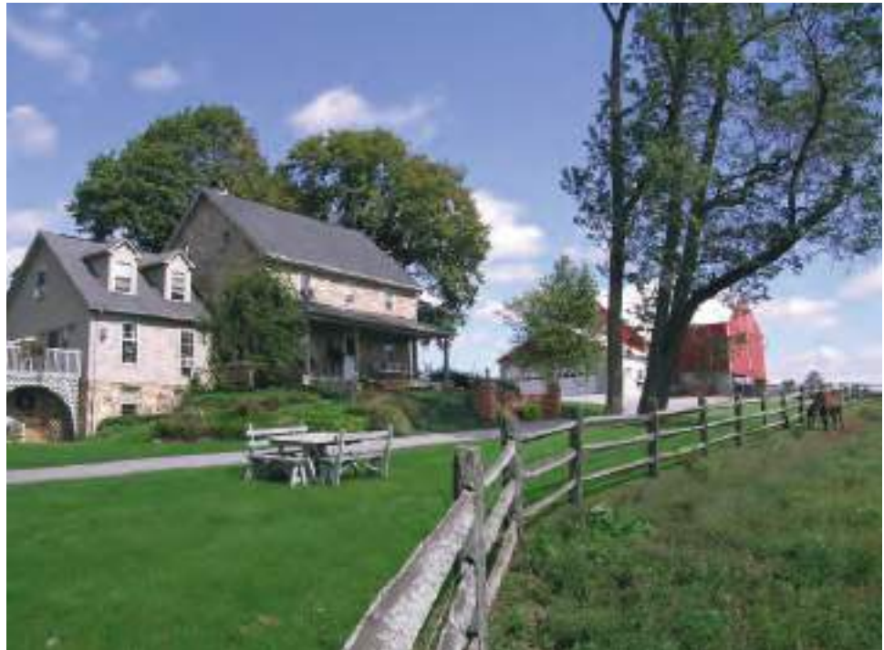
Historic resources in West Sadsbury are often framed by the agricultural landscape.

1.3.A Consider Establishing a Historical Commission. A Historical Commission can serve to advise the Board of Supervisors on matters dealing with identification, protection, conservation, management, promotion, and use of historic resources, located within the Township as described in Recommendation 4.4.A.