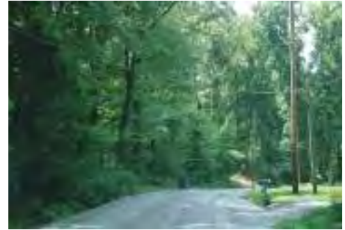
Much of the northern portion of the Township contains forested and rural residential properties.

Strategy: The Rural designation protects unique natural features and discourages higher intensity growth. Open space preservation and low-density residential development is appropriate in this area. Tools to complement the Rural designation include: large lot residential zoning, enhancing the Jim Landis Woodland Preserve, and establishing a regional transferable development rights program (as discussed in Recommendation 2.3.C) in which development rights would be sent from the Rural area, to receiving areas with infrastructure more appropriate for development. The existing zoning is the Rural District and is consistent with the Future Land Use plan.