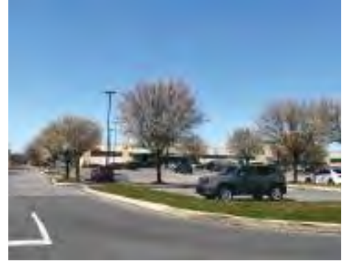
The West Sadsbury Commons Shopping center is designated as a commercial center.

Strategy: The Commercial Center designation reflects existing commercial establishments and adjacent properties which may be suitable for larger scale commercial development. Tools to complement the Commercial Center designation include establishing a regional transferable development rights program (as discussed in Recommendation 2.3.C). Any development or redevelopment in this area should integrate design elements discussed in Recommendation 5.1. The existing zoning is the General Commercial District and is consistent with the Future Land Use plan.