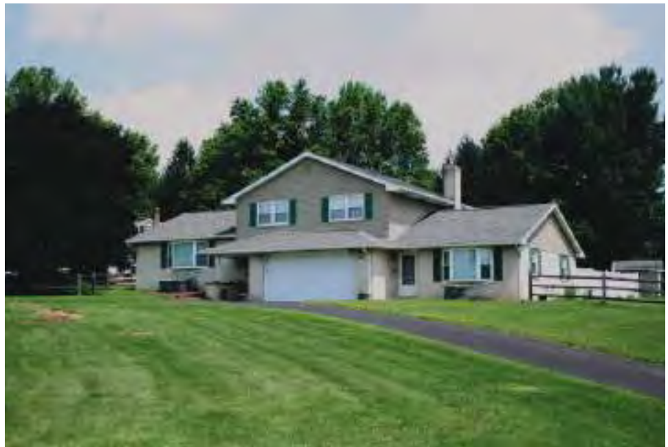
The most predominant type of housing in the Township are single family detached dwellings.

Consideration could be given to permitting more of the missing middle housing typologies throughout the Township. These typologies include a variety of multi-family options, constructed at a scale consistent with traditional residential neighborhoods. Regulations for these typologies should incorporate appropriate design standards and lot/bulk standards that respect established development patterns. Examples of uses permitted in the Township include duplexes, multiplexes, townhouses, and garden apartments. Additional typologies to consider can include, but are not limited to: triplexes, fourplexes, and residential conversions.