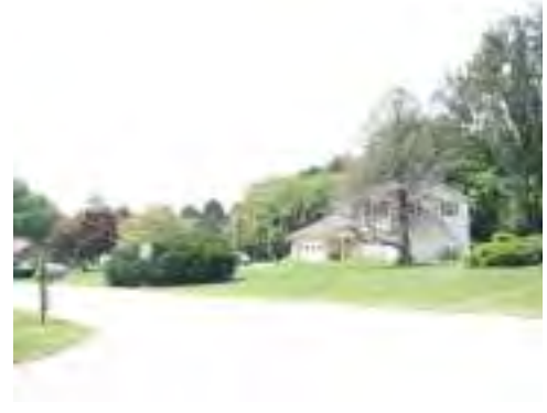
The neighborhood preservation designation includes existing single-family residential subdivisions

Strategy: The Neighborhood Preservation designation reflects existing residential development patterns in the Township. Low to medium density residential uses in scale with existing development are appropriate in this area. The existing zoning is the Low Density Residential and Medium Density Residential Districts and is consistent with the Future Land Use plan.