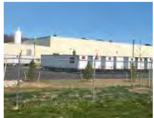
There are numerous industrial establishments in West Sadsbury along Lower Valley Road.