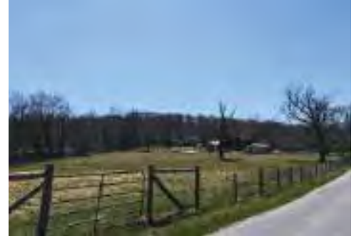
Agriculture constitutes West Sadsbury's largest future land use category by area.

Strategy: The Agriculture designation protects prime agricultural soils, and promotes the continuation of farming operations in the Township. Low-density residential uses limited to areas without prime agricultural soils are appropriate in this area. Tools to compliment the Agriculture designation include: large lot zoning, permitting cluster development in non-prime areas, and establishing a regional transferable development rights program (as discussed in Recommendation 2.3.C). The existing zoning is the Agricultural District and is consistent with the Future Land Use plan.