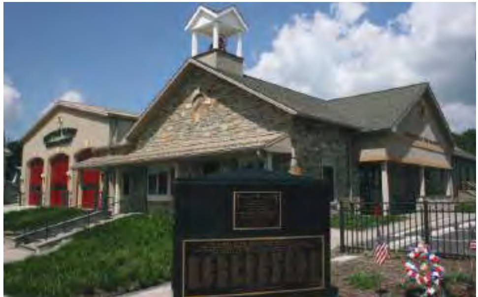
West Sadsbury is served by the Keystone Valley Fire Department, which is located in neighboring Parkesburg Borough.