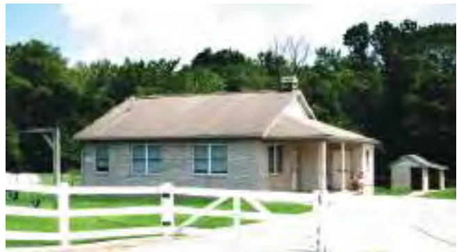
Although no public schools are located within the Township, Amish schools can be found providing educational opportunities to the Amish community.