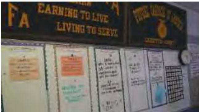
The Octorara High School provides a number of career and technical programs, including a robust agriculture program.