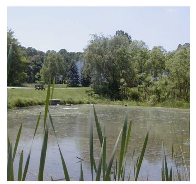
Stormwater retention basin (pond) integrates access for pedestrians as well as providing vegetation along the shoreline.

Goal 5 of the Watersheds plan is to "Reduce Stormwater Runoff and Flooding." Several objectives have been established to meet this goal. The ultimate and collective purpose of these objectives is to accommodate planned growth in a manner that protects public safety while sustaining ground water recharge, stream baseflows, stable stream channel processes and geomorphology conditions, the flood carrying capacity of streams and their floodplains, and ground water and surface water quality-to the maximum extent practicable. This can be accomplished through municipal implementation of "effective stormwater management," which includes ten principles.